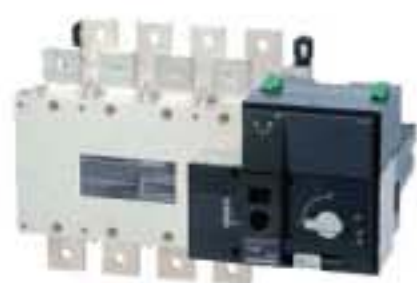
Power Transfer Switches