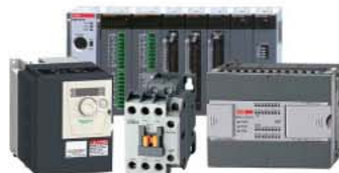
Automation and Control