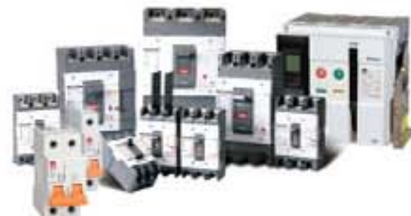
Power Distribution & Protection